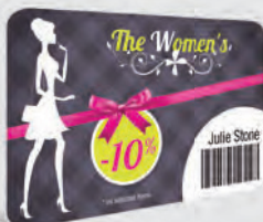
GIFT & SPECIAL OFFER CARDS