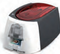
BADGY CARD PRINTER