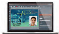
EVOLIS BADGE STUDIO® CARD DESIGNER SOFTWARE